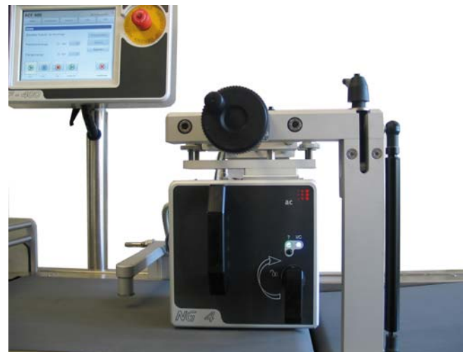
ACF-400 with the NGT4