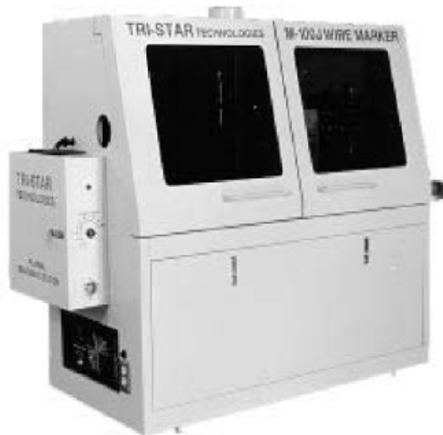
M-100J Ink Jet Wire & Cable Marker

The M-100J is a fully automatic, computer controlled, high speed ink jet wire and cable marking system. This new and unique wire processing system is the first in the industry to integrate an in-line plasma pre-treatment system. This proprietary plasma device not only enhances the quality and durability of the mark, but it also gives the M-100J the ability to print on almost any wire insulation material, including fluoropolymers (Tefzel, Teflon, etc..)